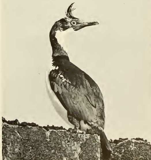
Figure 4. King Cormorant ( Phalacrocorax albiventer ).

In winter, albiventer (Fig. 4) is abundant in the eastern Strait of Magellan and far outnumbers the handful of atriceps that are present. In at-sea transects along the Patagonian coast, Jehl saw few cormorants; the majority were atriceps , which predominated as far north as Golfo San Jorge. Farther north, albiventer was by far commoner, except at Punta Leon, near Golfo Nuevo, where atriceps predominated on 18 June 1971. In the Golfo San José-Golfo Nuevo area, atriceps made up less than 10 per cent of the wintering flocks (Jehl et al., 1973). The reversal of abundance at Golfo San Jorge may be related to a sharp break in oceanographic conditions there (see Jehl, 1974).